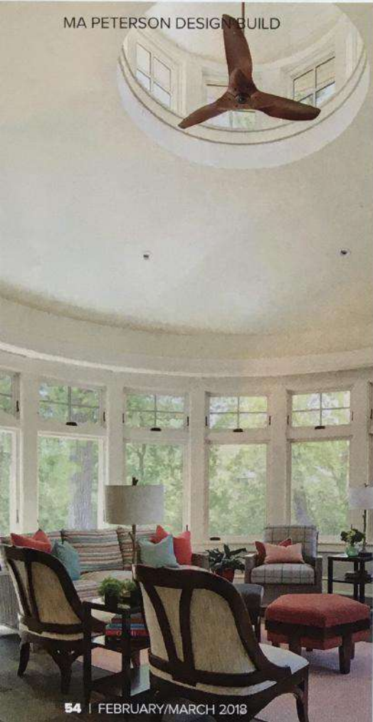
54 | FEBRUARY/MARCH 2018