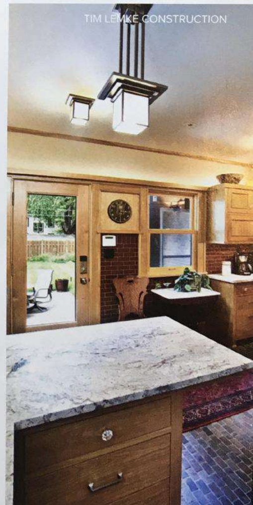
TIM LEMKE CONSTRUCTION

Challenges meet solutions in these three 2017 CotY winners