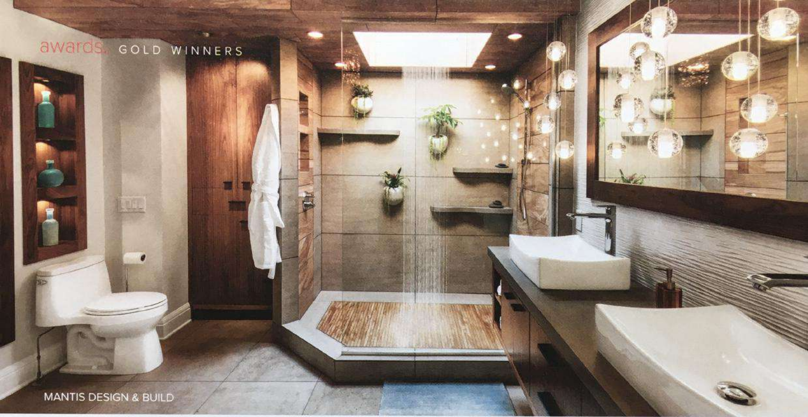
MANTIS DESIGN & BUILD